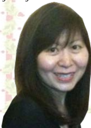
Glorify Thy Name

Every note, Every chord, Every Song, Every prayer that were played and strummed, sung and said echoed our Heavenly Father's Goodness, Faithfulness, Great Mercy and Great Grace. Awed and buoyed by his radiating love, we feel His Presence so near to us, we know He has never forsaken or forgotten us. A feeling of being reborn and renewed swept across our hearts as we celebrate, praising, worshipping and honouring our Father in Heaven, our Lord and Saviour; remembering yesterdays, recollecting our triumphs and tribulations, giving thanks for blessings received and praising many more tomorrows; God has kept us and we are growing closer to Him.